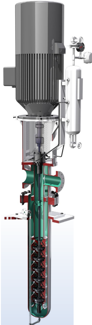
Canned Booster VS6